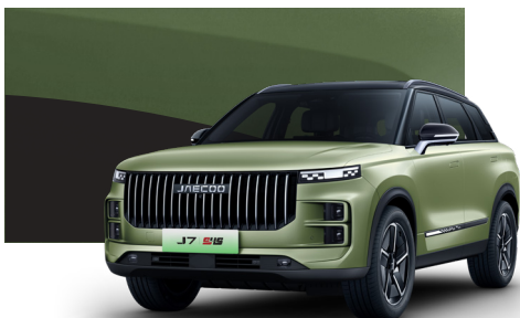
Forest Green with Carbon Black Roof*