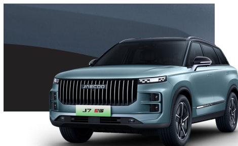
Ocean Blue with Carbon Black Roof*